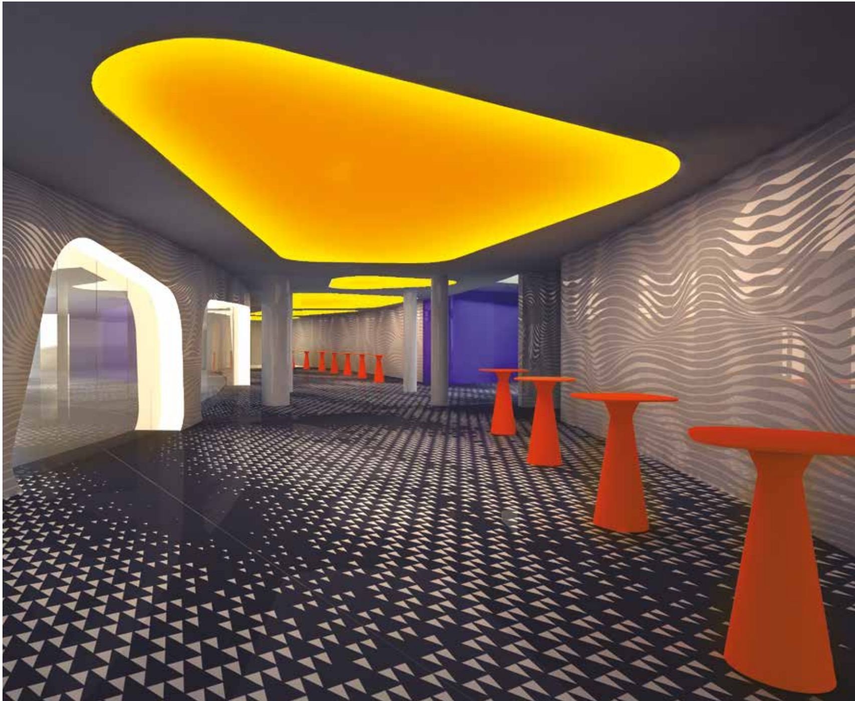
Pre-conference Area Artist impression