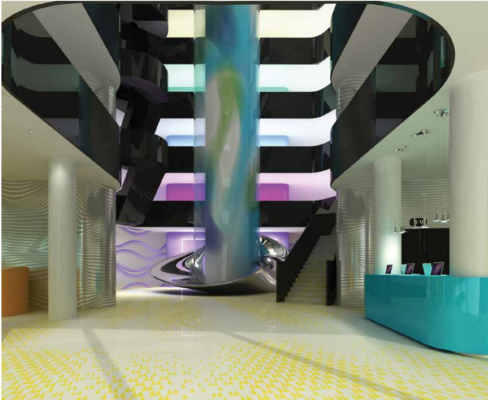
Lobby Artist impression