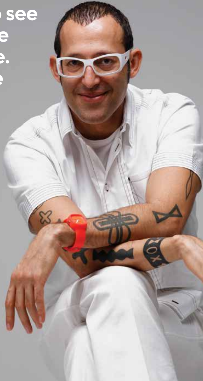
Karim Rashid, International Industrial Designer